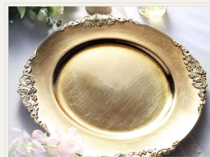
VINTAGE GOLD CHARGER