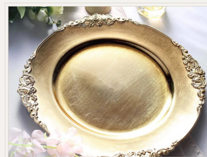
VINTAGE GOLD CHARGER